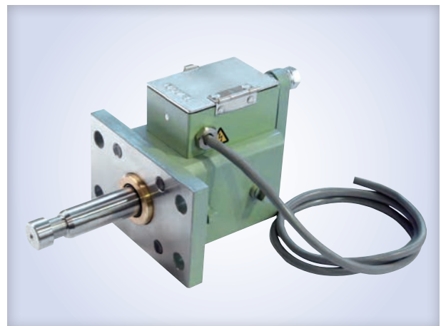
BC Model FA Double Rod Type (See P075) Accessories : MS/J-Type Arm