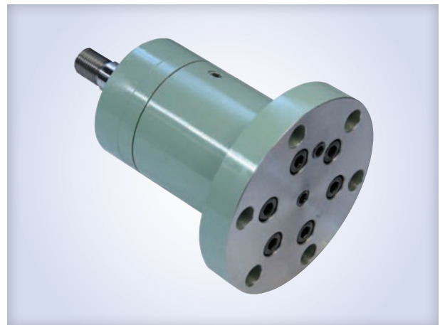
CP Model FB Type - Round Flange (See P053)