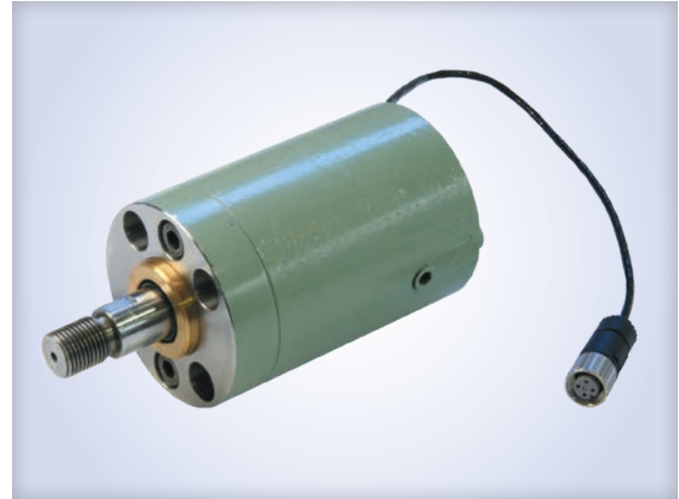
MMCII-Model Sleeve Sensor Built-in Type (See P105)