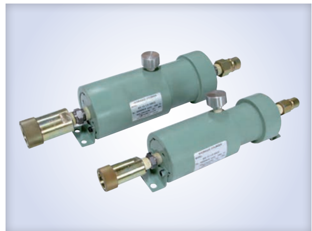
BS Model Booster Device (See P126)