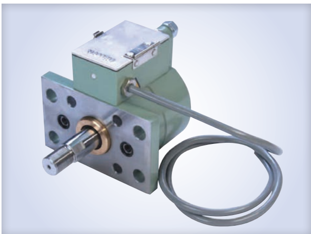
DC-Model FA Double Rod Type (See P113) Accessories : MS/J-Type Arm