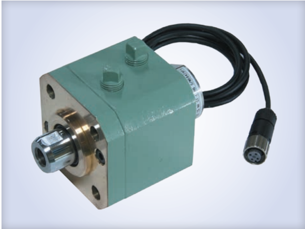
EXS-Model Magnetostrictive Sensor Built-in Type (See P099)