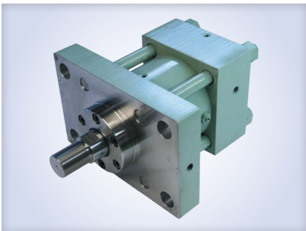
ST Model FA Type (See P069)