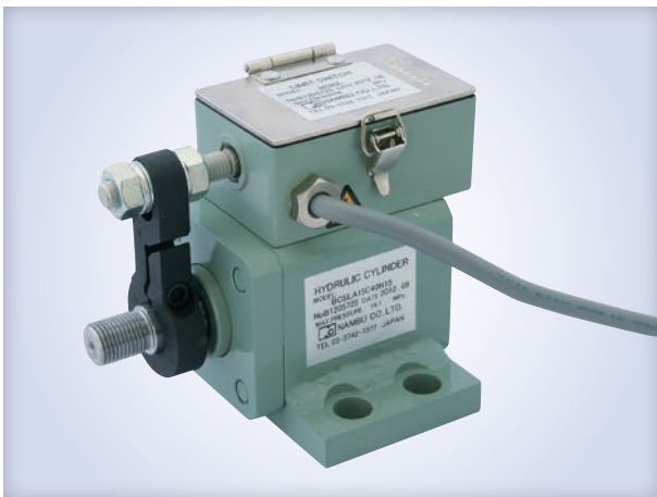
BC Model LA Type (See P075) Accessories : MS/J Type Arm