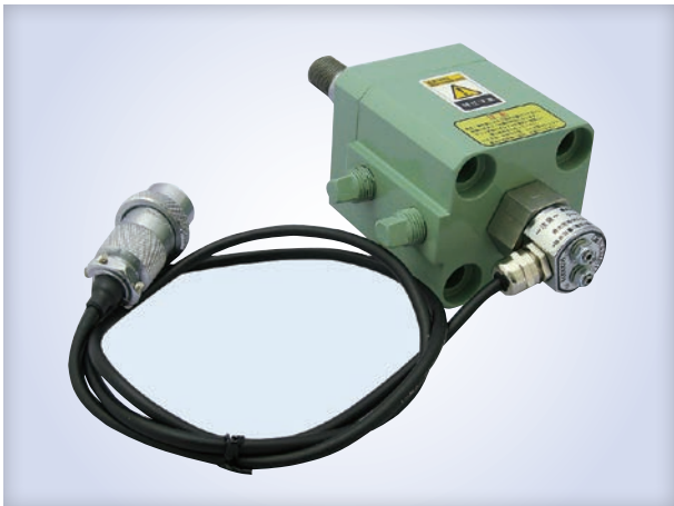
MCII-Model Reed Switch Built-in Type (See P091) *Connectors at cord end are optional.