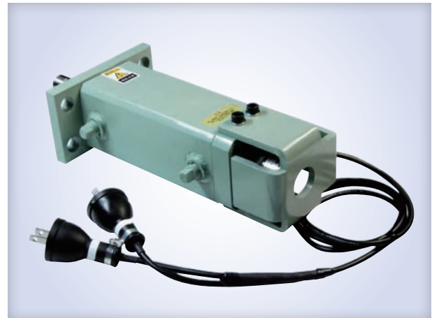
Protection cover of Reed Switch Attaching a BCC-Model Reed Switch Built-in Type *Connectors at cord end are optional.